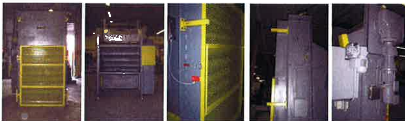
Front Load End Door Safety Switch Heavy Duty Construction Drive Assy