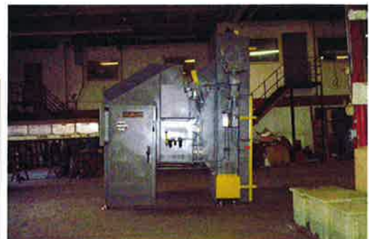
Drive Side View