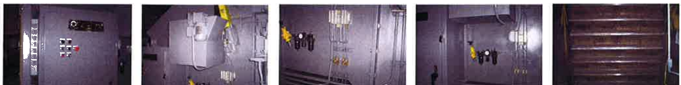
Control Panel Exit / Misfeed Return Pneumatic Controls Carousel Flights

For more information, call 614-253-8900 or visit us at www.alpha1induction.com