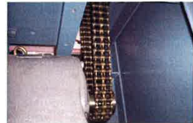
Gear box with chain drive

For more information, call 614-253-8900 or visit us at www.alpha1induction.com