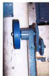
Lost motion assembly