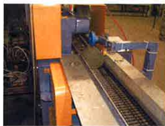
Manual adjust sides