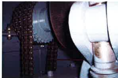
Chain driven lower steel knurled wheel