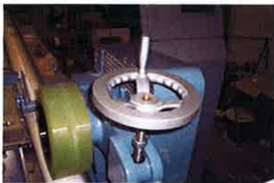
Manual adjust hand wheel