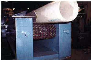
Wide multi-chain in-feed conveyor