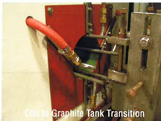
Coil to Graphite Tank Transition