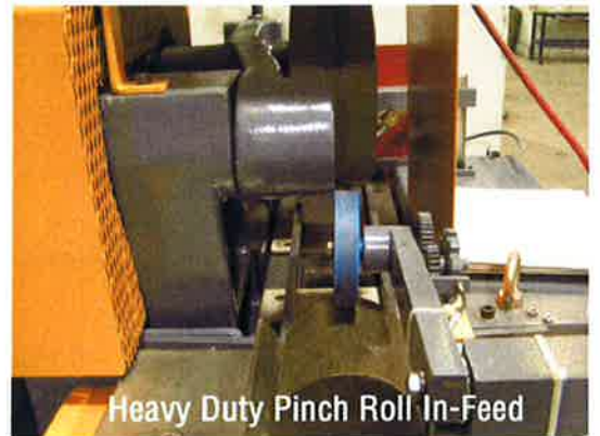
Heavy Duty Pinch Roll In-Feed

See our coil flyer for more information on why Alpha 1 surpasses the competition in coil quality