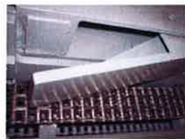
Reject Gate Detail