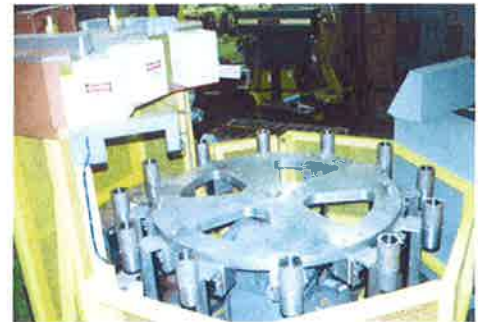
Turntable Feeding Systems