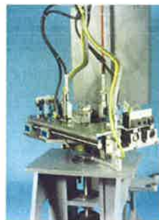
Pick & Place Systems