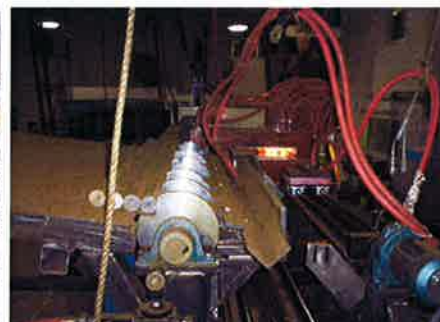
Bar Loading Systems