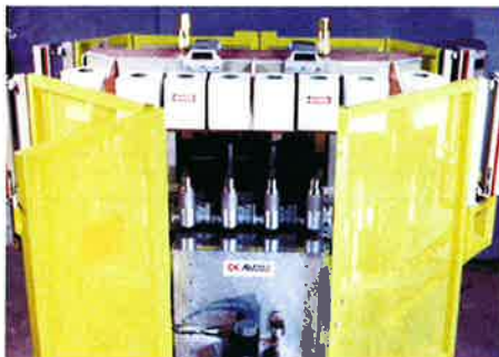
Carousel Handling Systems