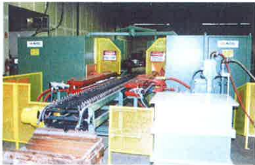
Conveyor Bar Feeding Systems

The Alpha 1 Induction Service Center is one of the Inductotherm Group of companies serving the forging industry. We specialize in the coils and material handling equipment required by today's forgers. This includes our standard step & rotary billet feeders, bin tipper, modular conveyors, fast extractors and billet reject systems. We also provide a variety of custom designed and manufactured material handling systems to meet the needs of our customers.