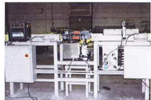
Billet Weigh & Reject Systems