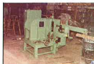
Bar & Rod Feeder