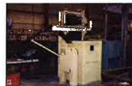
Standard Rotary Hopper Feeders